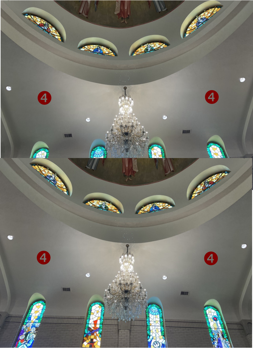
4 4 Evangelists (Matthew, Mark, Luke & John) $10,000 (each)