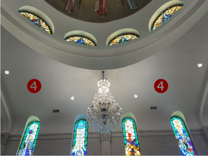
4 4 Evangelists (Matthew, Mark, Luke & John) $10,000 (each)