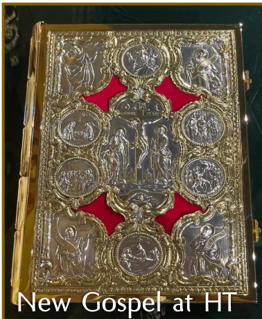
New Gospel at HT